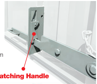
Rudco Auto-Latching Handle