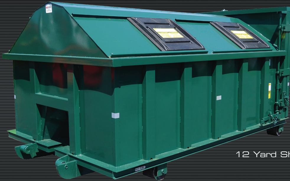
12 Yard Shown