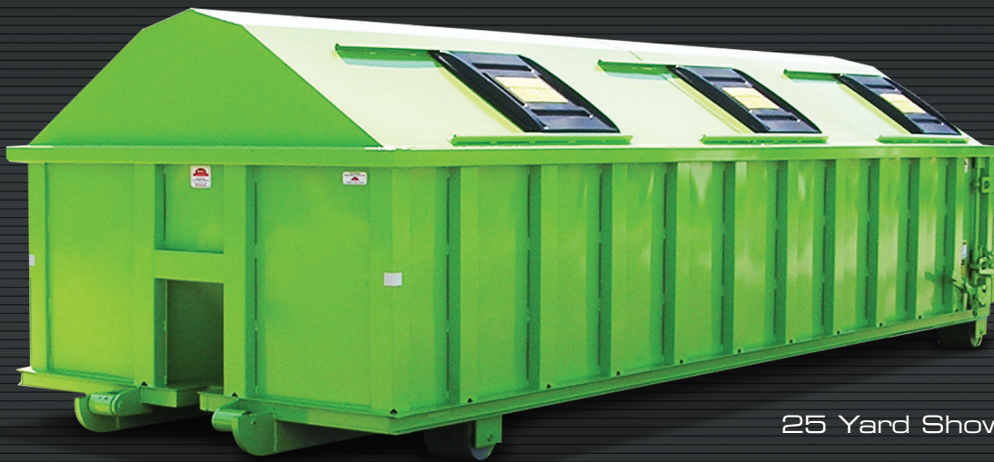
25 Yard Shown