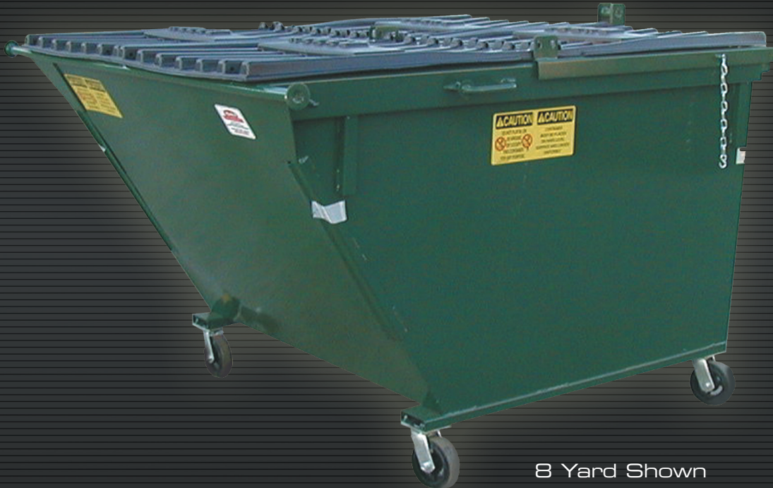
8 Yard Shown