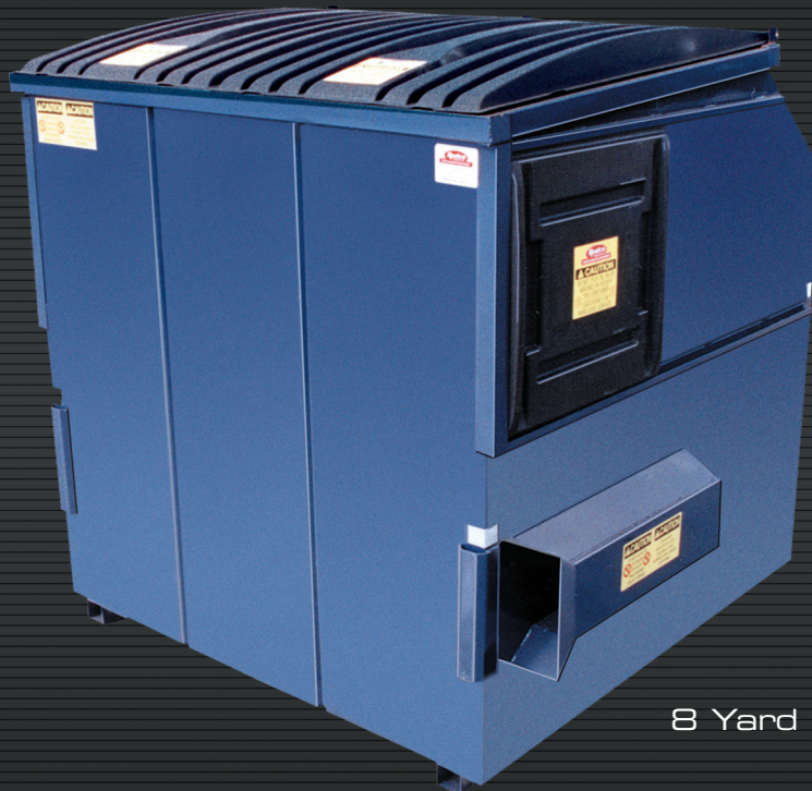
8 Yard Shown